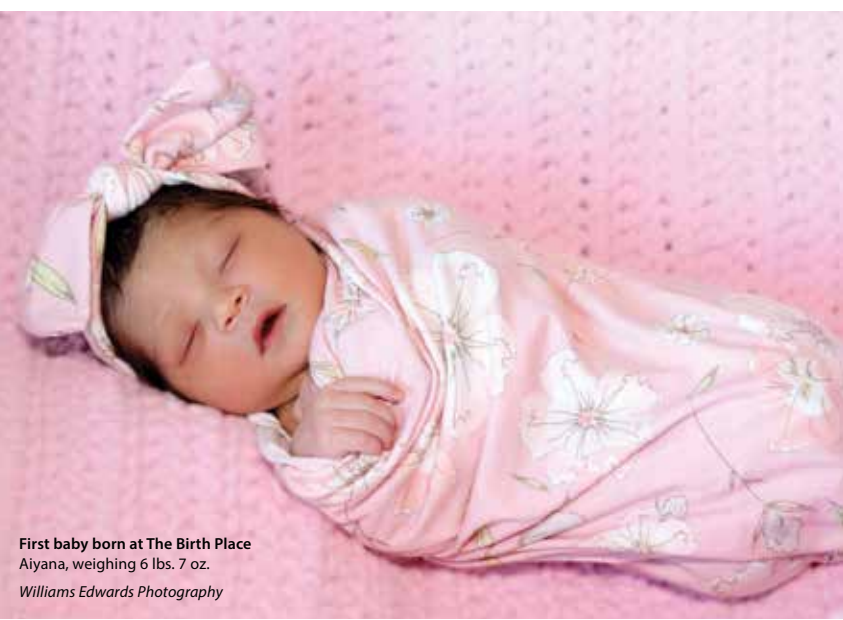
First baby born at The Birth Place Aiyana, weighing 6 lbs. 7 oz.